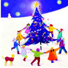
Christmas card A:

'Dancing Around the Christmas Tree' The message inside reads: 'Season's Greetings'