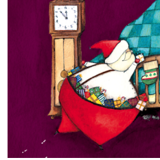
Christmas card C:

'Cherub's kiss' The message inside reads: 'With Best Wishes for Christmas and the New Year'